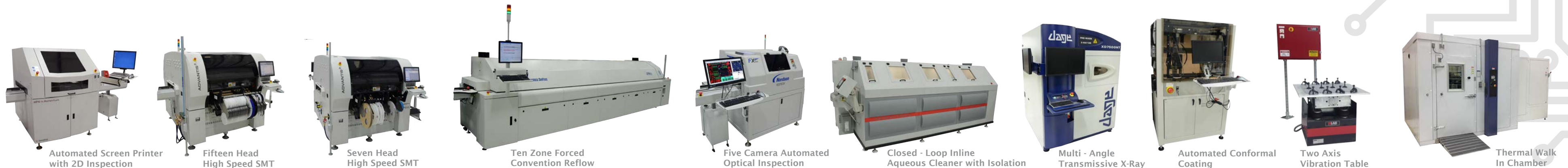
Automated Screen Printer with 2D Inspection